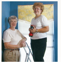
Area ladies enjoy decorating the children's homes.