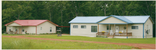
Ministers' Retirement Homes

8 miles east of Garrison & 13 miles west of Center