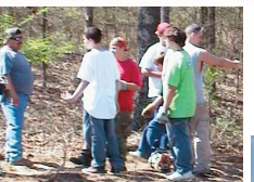
Youth groups serve the Lord on mission projects.