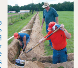
Church mission team volunteers work on the campus.